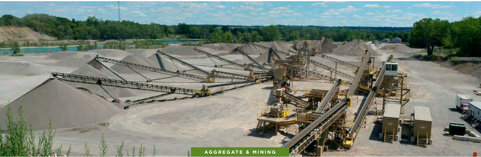
AGGREGATE & MINING